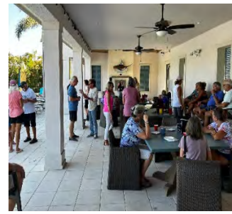
Music, food and drink were enjoyed by all